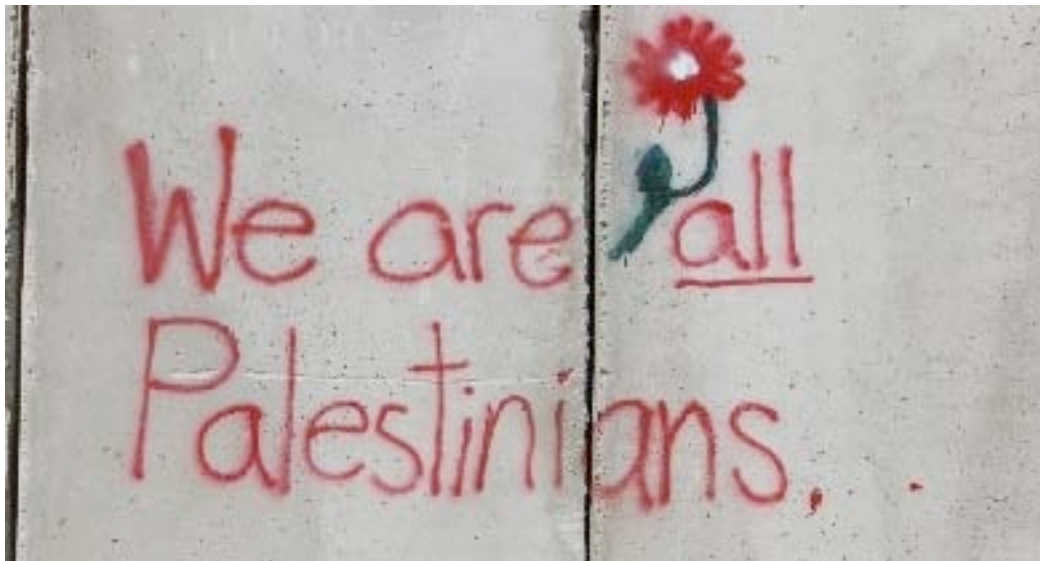
Graffiti on the separation wall

© Wendy Ross-Barker (2004) Tune – Stuttgart