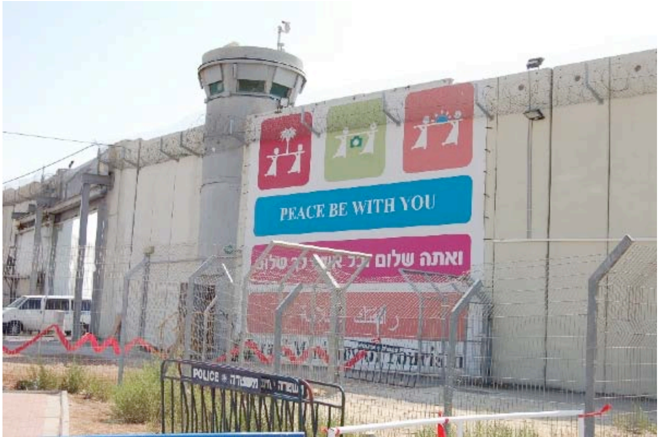
The gate at Bethlehem