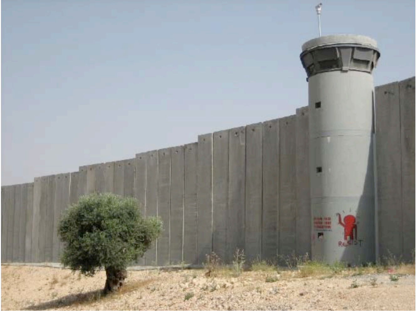
The separation wall