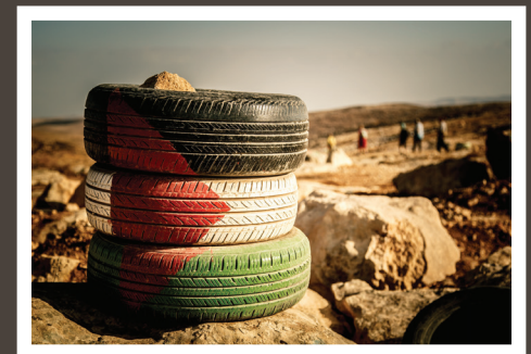
Painted tyres at Sumud Peace Camp in the South Hebron Hills — October 2017.