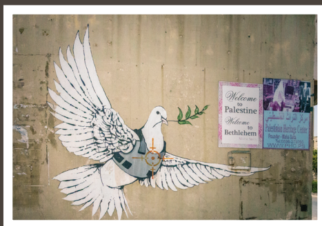
Banksy's 'Peace Dove' in Bethlehem, August 2016.

POPE FRANCIS, VISIT TO THE HOLY LAND — MAY 2014