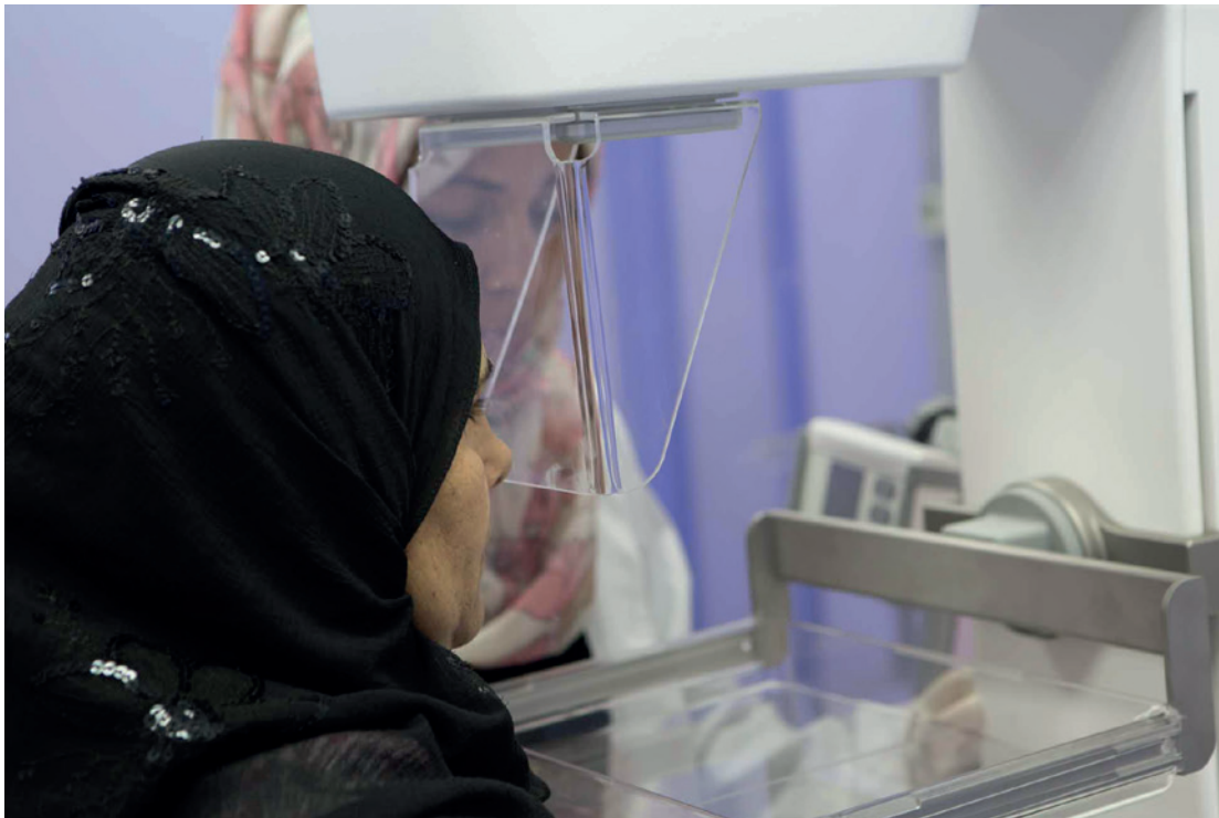
A woman being screened for early signs of breast cancer at AL AHLI HOSPITAL in Gaza City.