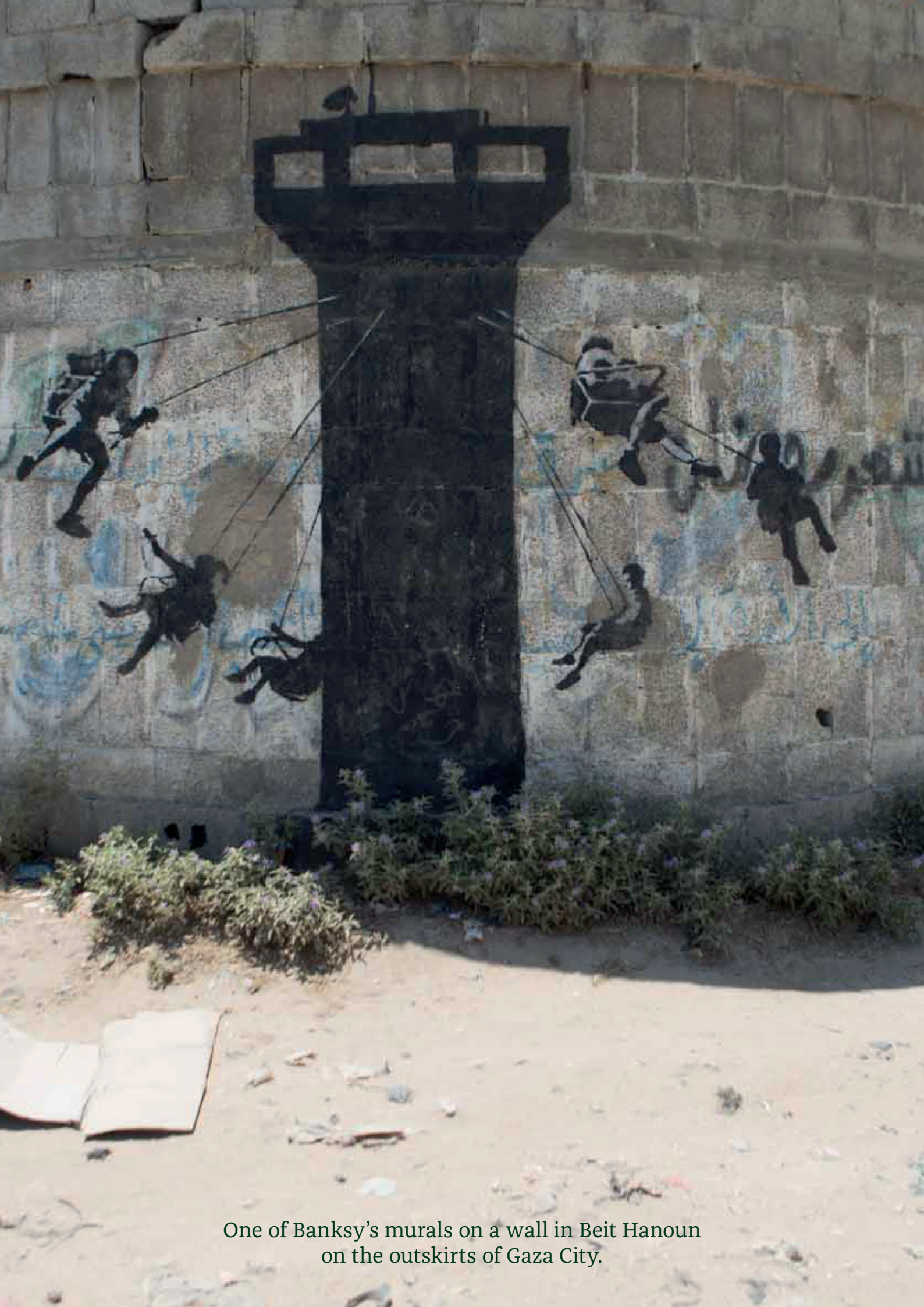
One of Banksy's murals on a wall in Beit Hanoun on the outskirts of Gaza City.