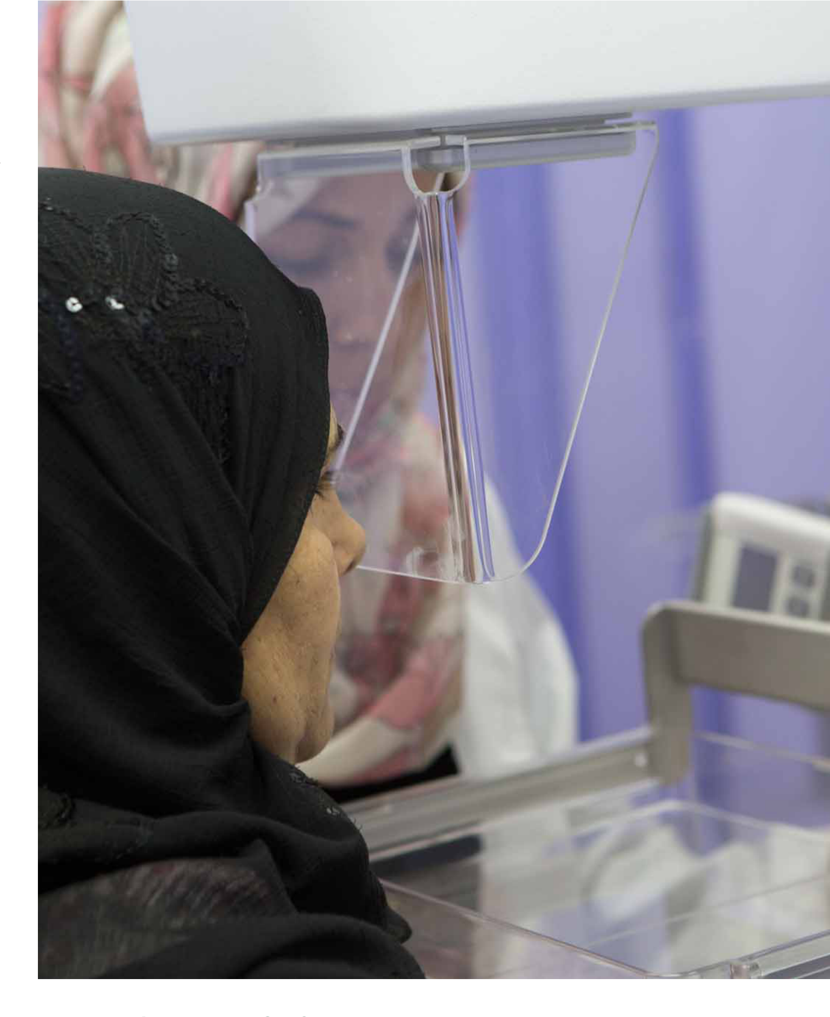
EARLY DETECTION SCREENING FOR EARLY SIGNS OF BREAST CANCER AT AL AHLI HOSPITAL IN GAZA CITY

During this period, cancer rates have risen dramatically in Gaza, which is particularly worrying for women, as breast cancer kills more women than any other form of cancer in Gaza and five-year survival rates for breast cancer are 30-40% compared to 87% in the UK.